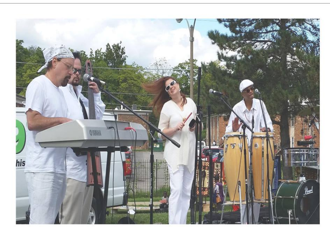
Fair St. Louisand many more local and State festivals.